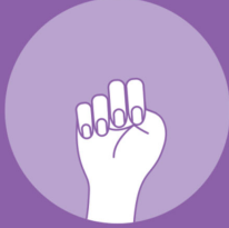
2. Trap thumb