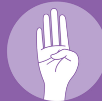
1. Palm to camera and tuck thumb