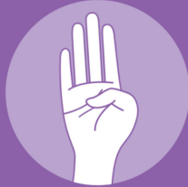
1. Palm to camera and tuck thumb